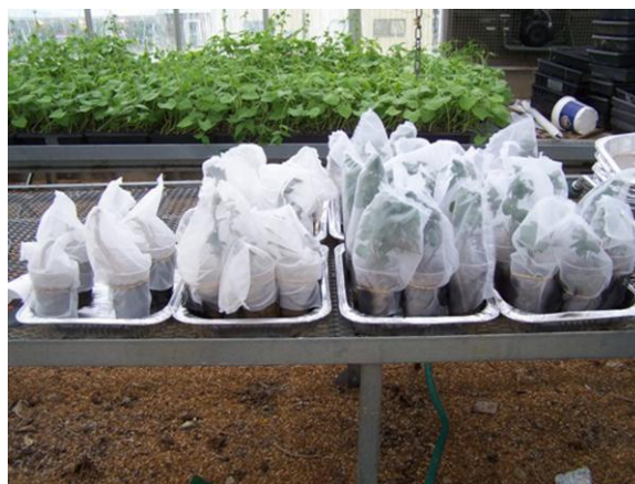
Figure 1. Sweetpotato plants covered with mesh cages in cups sitting in water reservoir pans. Cups on left are newly replanted, and cups on right were replanted approximately 10 d earlier.