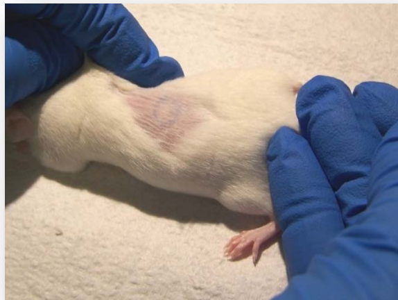
Figure 4. Mouse number 4.4 after one month showing no reaction to bed bug bites

During the 48-day study, none of the mice developed any outward signs of illness or distress. Further, none developed cutaneous reactions to the PBS “injections” or bed bug SGE (Figure 4), with the exception of one mouse which seemed to develop a transient erythematous response at the site of needle stick (Figure 5). After the mice were euthanized, pathology of skin punch biopsies revealed no specific allergy or inflammatory reactions in any of the sections (Figure 6). Also, there were no specific differences in skin samples among mice. All mice skin biopsies had sentinel (resident) numbers of mast cells, lymphocytes, and macrophages. It is possible, however, that there might have been an initial reaction upon each exposure that subsequently healed before pathological analysis. ELISA testing was negative as well. There was no reactivity of any sera from bitten or SGE-injected mice to SGE proteins used in the ELISA, and all results were no different from that of the negative controls used in the test, meaning that the mice failed to produce measurable antibodies to SGE or bed bug bites during the 48 day exposure(s).