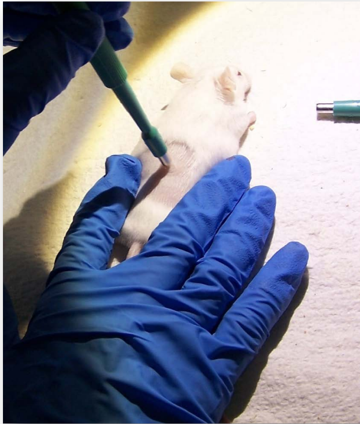
Figure 3. Punch biopsies of bite and injection sites.

ELISA procedures. For detecting antibodies in mouse sera, 96-well Costar high-binding EIA plates were coated with SGE at a concentration of 0.5ug per 100µl of carbonate (50 mM NaHCO 3 ) buffer and incubated overnight at 4°C. Plates were washed 3 times with 200 µl PBS/Tween. Blocking was performed by adding 200 µl of wash buffer + 5% nonfat dry milk and placing the plate on a rotator for 2 hours at 150 rpm. Plates were again washed (3x 200 µl wash buffer) and 100 µl of mouse serum diluted to 1:200 was added to the wells and the plate was placed on a rotator for 1 hour at 150 rpm. Plates were again washed (3x 200 µl wash buffer) and anti-mouse IgG, IgM, IgA. Secondary antibody (Life Technologies) was added at a dilution of 1:1000 in 200 µl of blocking buffer. Following another wash (3x 200 µl wash buffer), equal parts of TMP Peroxidase Substrate + Peroxidase Substrate Solution B (Kirkegaard & Perry Labs) were added at 100µl/well. Exactly 10 minutes later, 100µl stop buffer (1M HPO 4 ) was added. Plates were read at 450nm on an ELISA plate reader (Biotek instruments).