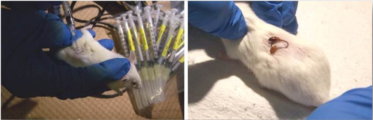
Figure 1. Injection of bed bug salivary gland extract and bed bug adults feeding.