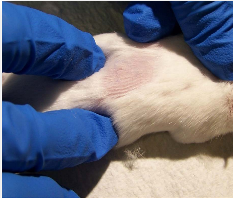
Figure 5. Mouse number 2.3 developed a transient small lesion at site of injection.